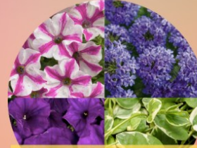
Mixed Baskets* Full/Part Sun