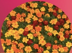
Marigold Full/Part Sun