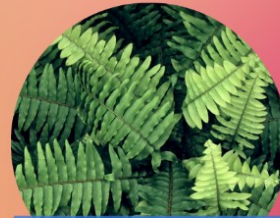
Boston Fern Full Shade