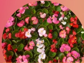
Wax Begonia Full/Part Sun