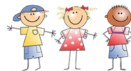
Trinity Christian Preschool