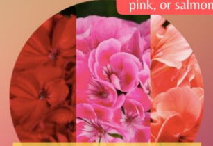
Geranium Full/Part Sun