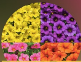
Superbell* Full/Part Sun