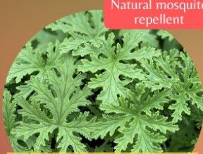
Citronella Full/Part Sun