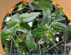
Bridal Veil Full Shade