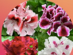
Martha Washington* Part Sun