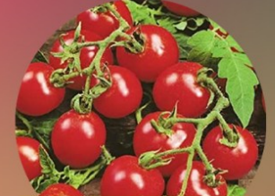
Husky Cherry Full/Part Sun