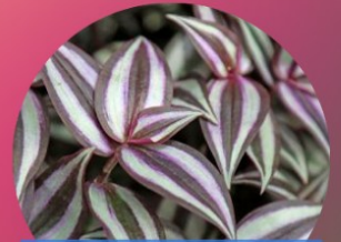
Wandering Jew Full Shade