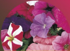
Petunia Full/Part Sun