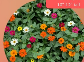
Zinnia Full Sun