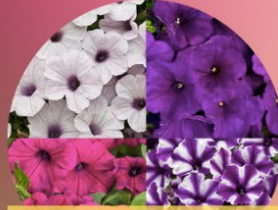
Petunia* Full/Part Sun