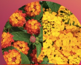
Lantana* Full Sun