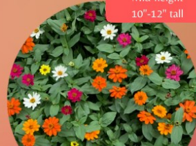
Zinnia Full Sun