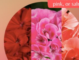
Geranium Full/Part Sun