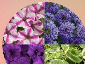
Mixed Baskets* Full/Part Sun