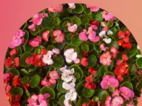
Wax Begonia Full/Part Sun