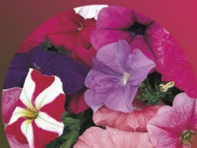
Petunia Full/Part Sun