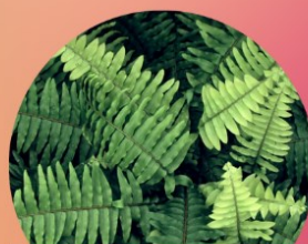
Boston Fern Full Shade