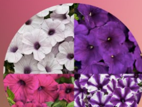
Petunia* Full/Part Sun