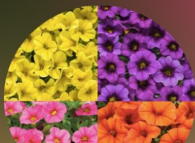
Superbell* Full/Part Sun