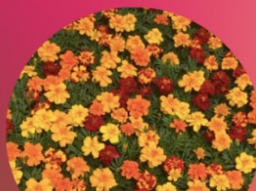
Marigold Full/Part Sun