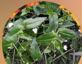
Bridal Veil Full Shade