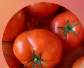
Husky Red Full/Part Sun