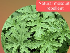
Citronella Full/Part Sun