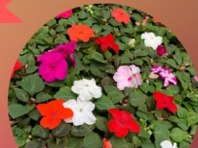
Impatiens Part Sun