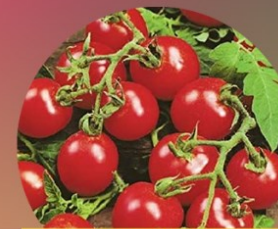
Husky Cherry Full/Part Sun