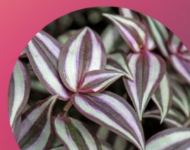
Wandering Jew Full Shade