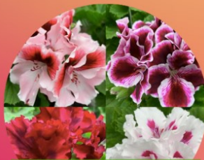
Martha Washington* Part Sun