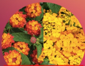
Lantana* Full Sun