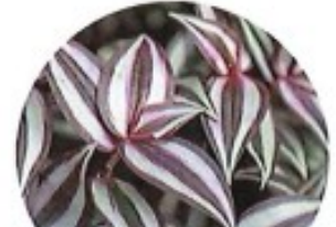
Wandering Jew Full Shade