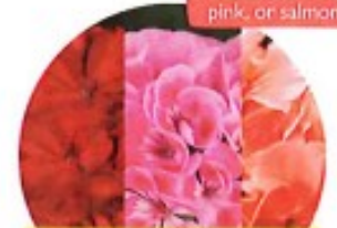
Geranium Full/Part Sun