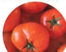
Husky Red Full/Part Sun