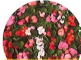
Wax Begonia Full/Part Sun