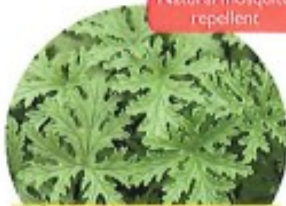
14" Citronella Full/Part Sun