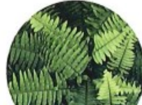
Boston Fern Full Shade