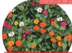
Zinnia Full Sun