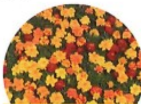
Marigold Full/Part Sun