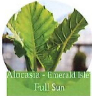
Alocasia - Emerald Isle Full Sun