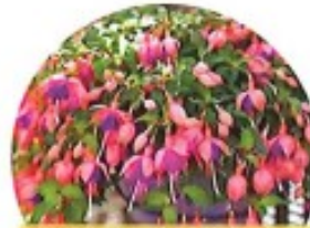
Fuchsia* Partial Shade