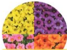
Superbell* Full/Part Sun