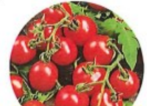
Husky Cherry Full/Part Sun