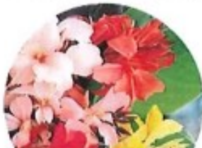
Canna Full Sun