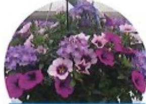
Sun Combos & Shade Combos