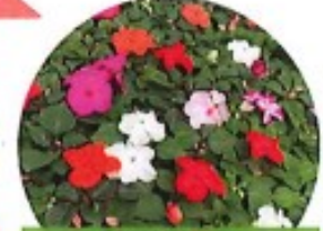
Impatiens Part Sun