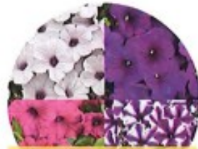
Supertonia* Full/Part Sun