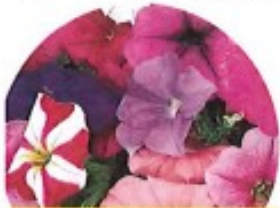
Petunia Full/Part Sun