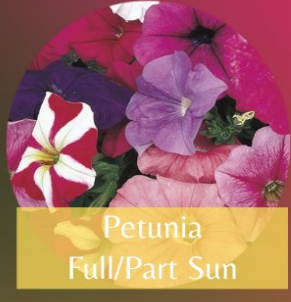
36 Count Flats: $22